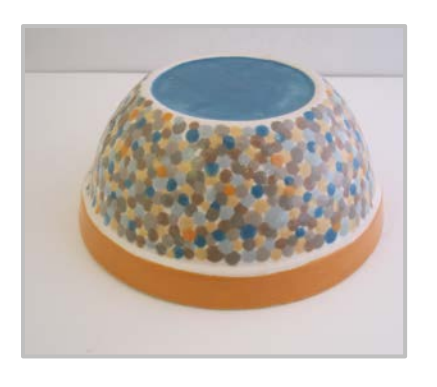
October 1<sup>st</sup> Qtips

You'll be amazed at what an ordinary Qtip can do! Let us show you how to create unique texture with layers of colors.