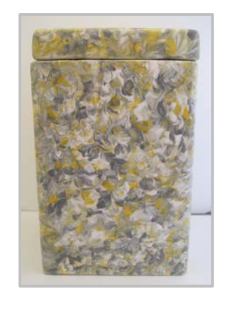
October 15<sup>th</sup> Fingerpainting

Who said fingerpainting is just for kids? Unique designs abound when you abandon brushes and let your fingers do the talking. We will throw some color theory into the mix.